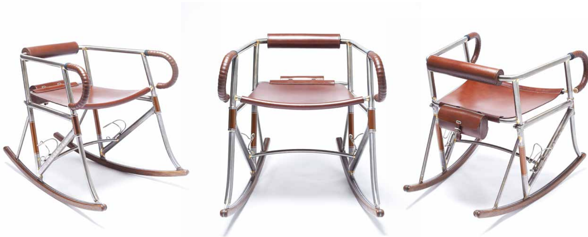
The Randonneur Chair